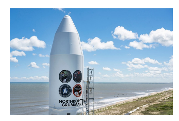
NROL-129 launches out of NASA's Wallops Flight Facility, Virginia, on July 15, 2020.

In January 2020, NRO collaborated with Rocket Lab and the New Zealand Space Agency to launch NROL-151, our first dedicated mission from New Zealand. NROL-151 was the first launch under the NRO's RASR contract.